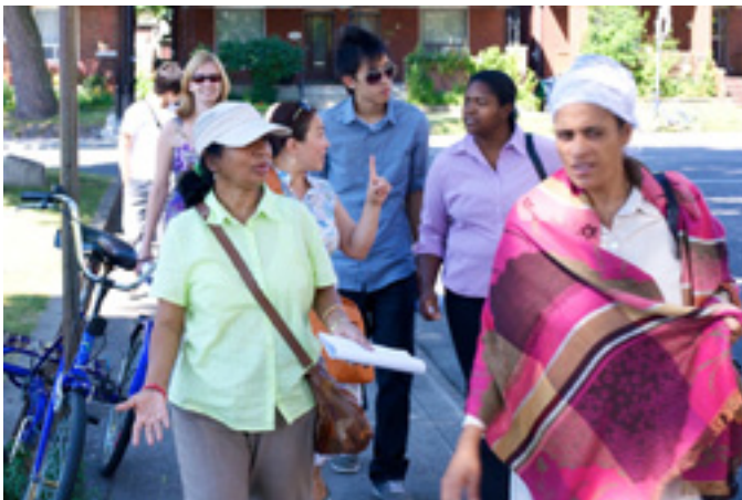
A group of graduate students and KGO animators set out to administer the APCOL survey.

First, it was necessary to refer to the survey as a questionnaire and interview as a means to better describe the depth and unique characteristics of the overall APCOL project. Like the word ‘activist’, the word ‘survey’ was also pre-loaded with a specific meaning for many.