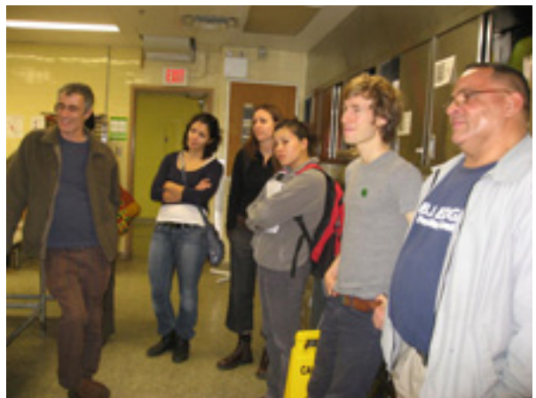
Members of the Food Activist group tour the FoodShare kitchen and learn about its training and student nutrition program.

In reflecting on our collective work, the Food Activists noted the strength of working together and overcoming the fear of doing things differently. Several of the concrete learnings included becoming receptive to